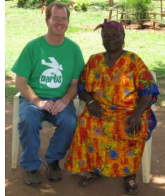
Free SAF t-shirt if you can identify this Kenyan woman and her famous relative.