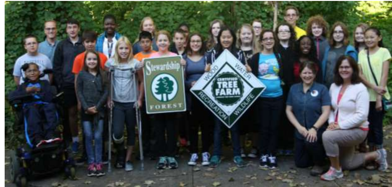
Frost Middle School in Livonia